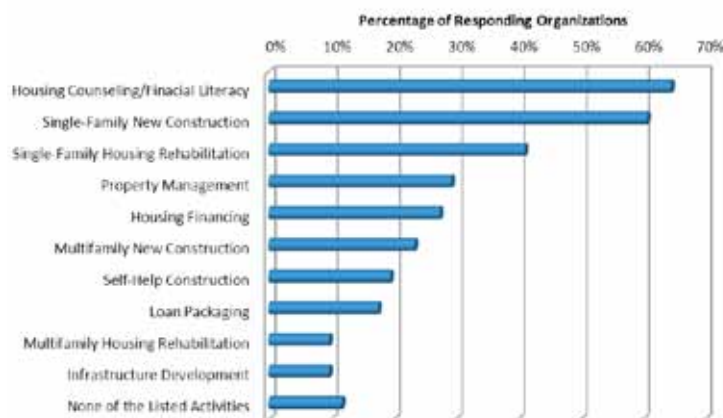
Fig. 2. Housing Programs Operated by Organizations in the Lower Mississippi Delta

Source: Housing Assistance Council, forthcoming, 13.