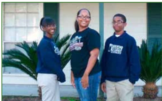
A first-time homebuyer with her family and new home.

The organization takes a holistic approach to restoring low-income communities based on the following premises: (1)