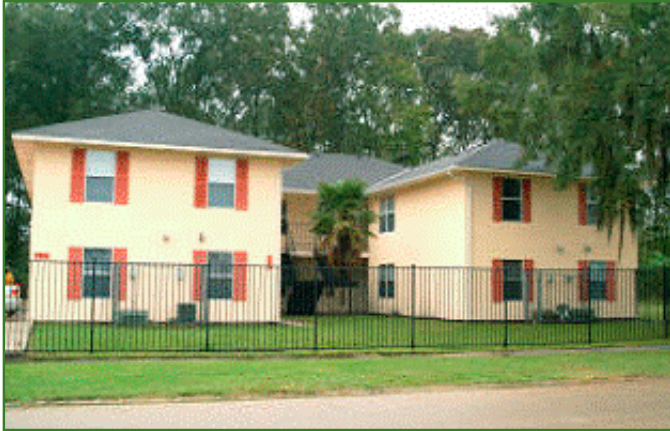
The "Grandparents' House" apartment community.

Individual Development Account program, which helps potential homebuyers obtain subsidies to purchase a home.