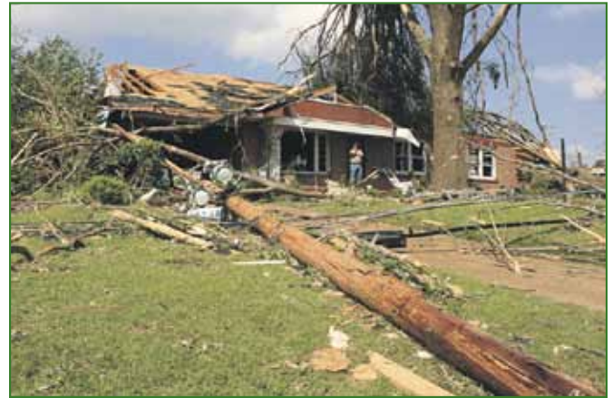
A home damaged by the tornado in April.