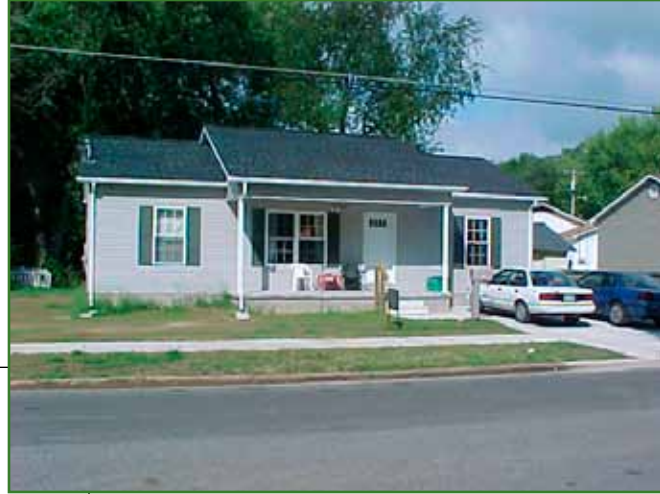
Before and after photos of a home that was rehabilitated by Purchase Area Housing Corporation under the City of Mayfield Scattered-Site Housing Rehabilitation Program. This house is located in Graves County, Kentucky.