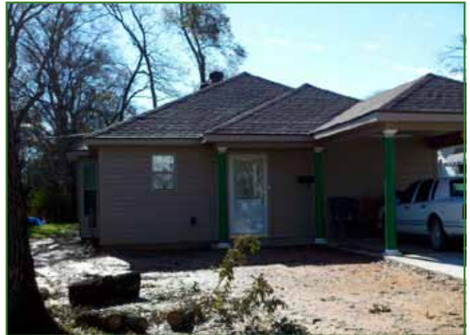
The family was able to move from their old home into this new self-help home with the assistance of Seventh District Pavilion, Inc.

Seventh District Pavilion, Inc. is a nonprofit 501(c)(3) organization located in Crowley, Louisiana. The Pavilion's mission is to provide decent, safe, sanitary, secure, and affordable housing opportunities to very low-, low-, and moderate-income families in target areas, which include the parishes of Acadia, Calcasieu, Evangeline, Jefferson Davis, Lafayette, St. Landry, and Vermilion. The organization works toward this mission through its self-help housing program and through its roles as a housing counseling agency and a Community Housing Development Organization (CHDO).