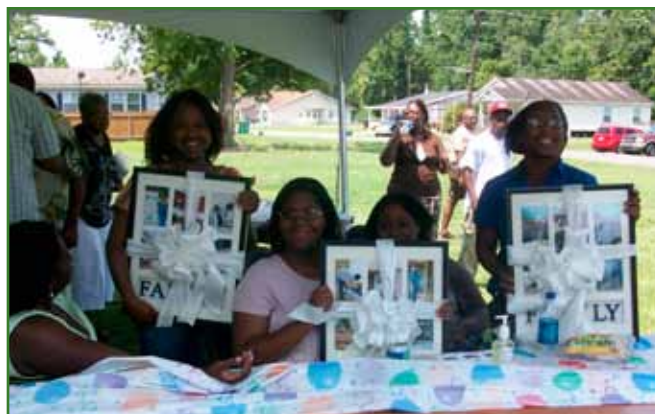
Four families move into their self-help homes and celebrate National Homeownership Month on June 30, 2010, in Boutte, Louisiana.

As a result of the economic downturn, some families have been forced to withdraw from the program due to loss of employment. Family Resources has been able to recruit new families by expanding the service area to address