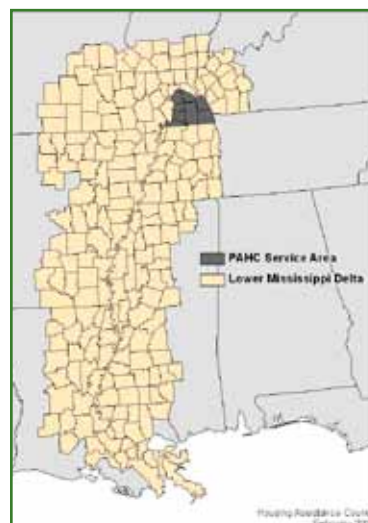
Lower Mississippi Delta region with PAHC service area counties highlighted.

The Purchase Area Housing Corporation (PAHC) was formed in 1984 by the Purchase Area Development District, one of Kentucky's 15 regional planning and development agencies. PAHC was organized as an eight-county regional nonprofit housing corporation with the purpose of providing safe, sanitary, and decent housing throughout the Jackson Purchase region of extreme western Kentucky. The area is comprised of eight counties: Ballard, Calloway, Carlisle, Fulton, Graves, Hickman, Marshall, and McCracken. PAHC's programs include housing rehabilitation, homebuyer projects, housing counseling, and homelessness prevention. In addition, the organization manages several rental units and housing complexes for elderly residents.