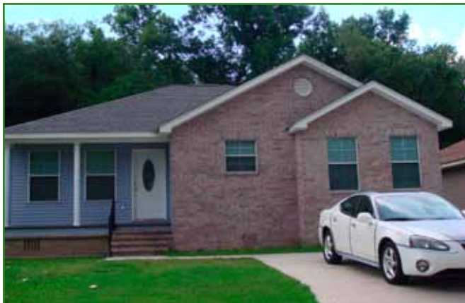
Self-help home in Boutte, Louisiana.

As a housing counseling agency certified by the U.S. Department of Housing and Urban Development (HUD), Family Resources offers services including pre- and post-purchase counseling, credit counseling, homebuyer training and education, financial literacy, default and foreclosure prevention counseling, individual development savings accounts (IDAs), new home construction through the USDA Mutual Self-Help Housing Program, and referrals to other social service organizations.