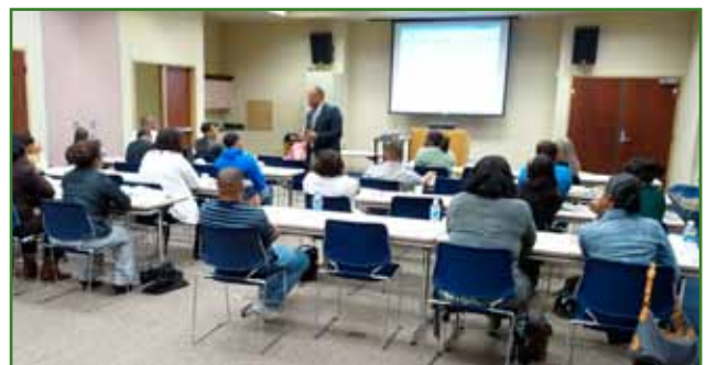
A UREC training class.