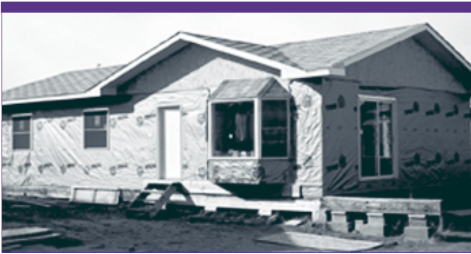
This new self-help home being constructed at an OSTPH site will be moved to the land of the woman shown on page 108 when completed.

The Oglala Sioux (Lakota) Housing Authority, located in the village of Pine Ridge, provides most of the low-cost rental housing in the village. The housing authority is the entity designated by the tribe to receive and spend block grant funds provided by HUD to the tribe pursuant to the Native American Housing Assistance and Self Determination Act (NAHASDA). It also uses the USDA Rural Development/Rural Housing Service programs.