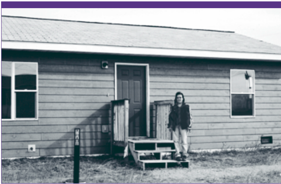
The director of the Lakota Fund's Individual Development Account program shows off one of the rental homes developed and managed by the fund outside the village of Wanblee.

20 percent lack complete plumbing facilities. While an estimated 55 percent of Pine Ridge households are linked to a public sewer system, approximately 21 percent dispose of sewage by other means, excluding a septic tank or cesspool. 45