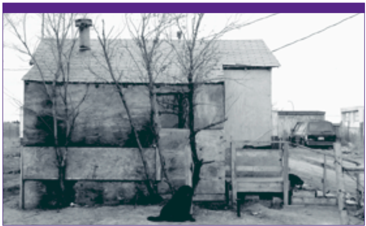
This small, weather-beaten house is typical of homes on the Pine Ridge reservation.

HAC researchers conducted case study research on the Pine Ridge reservation in the early 1980s and in 1994, and in February 2002 returned to investigate the prevailing housing conditions. The legacy left by more than two centuries of colonial subjugation and economic marginalization is still quite visible on the reservation. HAC found that, since 1990, the general scope of the economic deprivation on Pine Ridge has remained largely unchanged. Pine Ridge still bears the unenviable distinction of being one of the least developed Native reservations in the United States, characterized by a lack of economic and physical infrastructure, a shortage of services, prevalent substandard housing, and high rates of diseases like diabetes, tuberculosis, and alcoholism. The reservation still lacks a strong economic base, private-sector investment continues to be minimal, and the population remains impoverished. At the same time, efforts to improve life at Pine Ridge continue.