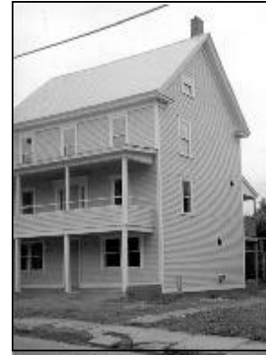
Figure 7. A six-bedroom rehabilitation in Gilman, Vt.

VCLF is providing the bridge financing. A construction crew member on the site commented, “To appreciate the job we did, you’d really have to have seen this place before we took it over. You wouldn’t have believed it. It was an abandoned crack house – utterly disgusting.” In spite of the extensive rehabilitation, the house was kept affordable through the use of minimum-risk Department of Corrections labor, who received two days of credit off their jail sentences for every day spent working on the Gilman Housing Trust crew. One Gilman staff member stated that the program works extremely well, because most of the laborers they get are highly skilled tradesmen who have been sentenced for driving while intoxicated. There is very little training involved, and participants are relieved to have their jail sentences halved.