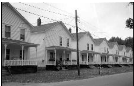
Figure 8. Historic row houses, Ryegate, Vt.

Another rehabilitation project in Ryegate, Vt. involved a row of historical houses originally used to house local mill workers at the turn of the twentieth century. The Gilman Housing Trust purchased the houses and rehabilitated them with the goal of using them as rent-to-own units (Figure 8). The original financing for the project came from the Vermont Housing Finance Agency, USDA RHS, and the Neighborhood Reinvestment Corporation. (Gilman is a NeighborWorks® Network affiliate.) However, in the middle of the rehabilitation process, Gilman discovered lead paint and asbestos in the units. The organization also discovered that, contrary to the word of the previous owner, the site had no access to local sewer lines. Gilman applied for a $180,000 loan from VCLF to cover the additional lead and asbestos abatement costs, as well as the cost of putting in a septic tank. VCLF approved the loan and, in return, was granted first position on the mortgage.