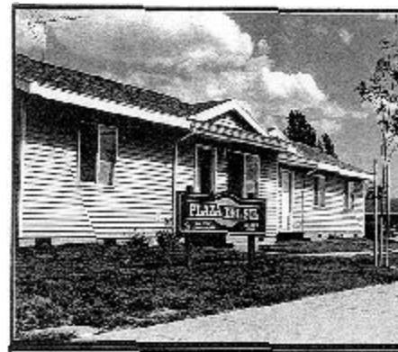
Figure 10. Plaza del Sol, Sunnyside, Wash.

Flexibility of loan terms has been important to Tri-State borrowers in part because of the obstacles posed by NIMBY opposition. Some farmworker developments have had to withstand multiple legal and regulatory challenges by neighbors before they were able to begin construction. In one instance, the sponsors of the Plaza del Sol complex in Sunnyside, Wash. had to weather two months of public hearings over a challenge to the Conditional Use Permit (CUP) application that would have enabled the developer to build fourplexes, rather than duplexes, on the site. The developer finally withdrew the CUP application, hoping to begin construction; however, the neighbors then challenged the project’s environmental review. The zero interest, flexible term Tri-State funds enabled the developer to maintain site control during this entire process and eventually finish the project (Figure 10).