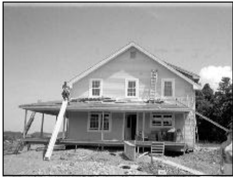
Figure 9. Future elder home-care facility, Vergennes, Vt.

All of the borrowers or borrower groups to which VCLF lends must serve low-income Vermonters. Out of 16 total borrowers, 13 are VCLF's nonprofit community development land trust borrowers, and the remaining three are business loan borrowers (Table 20). Two of the business loans are to women-owned businesses, one of which is a Mexican food restaurant and the other a food manufacturing operation. 14 Although VCLF did not have any minority borrower groups or business owners at the time of this study, the state as a whole has a 96.8 percent white population, with most of the racial and ethnic minorities concentrated around the Burlington metropolitan area.