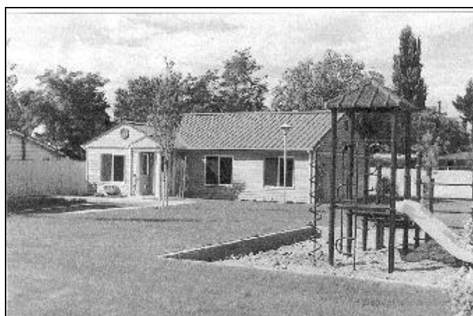
Figure 11. Mariposa Park, Yakima, Wash.

Not only do Tri-State funded development projects reach a minority population that is among the most poorly housed in the nation, they also create living environments that are child-friendly, enabling farmworkers to travel with their families. For example, the ORFH-funded Linda Vista housing complex includes a day-care center, and all other complexes (like Mariposa Park, Figure 11, and Abbey Heights, Figure 12) include safe playground areas. Farmworker family amenities such as these are highly unusual in an industry where housing arrangements have historically been limited to “bullpen” or “horse-stall” dormitories for unaccompanied men (Bell 1997).