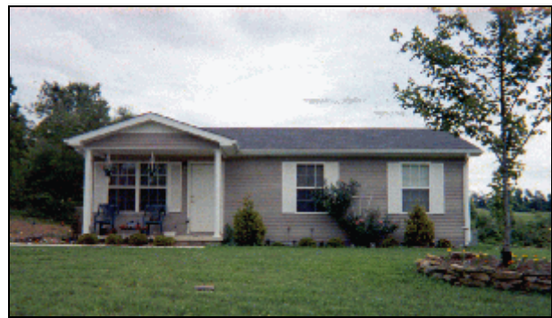
Figure 1. The young homeowner's new home, built by KMHDC.

The two borrowers interviewed for this case study reflect these characteristics. One borrower was a young woman in her early twenties who heard about the New Home Loan program from a relative whose house was rehabilitated by KMHDC. According to the executive director, most of the applicants who come into the office hear about the loan programs through word of mouth. The young woman was able to purchase a newly