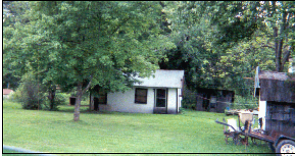
Figure 2. The converted tool shed where the young homeowner's aunt lives.

built home from KMHDC that is located down the road from her mother, her grandmother, and her aunt (who is also applying for a New Home Loan) (Figure 1). The aunt, who is experiencing financial distress after a divorce, is living at the back of the grandmother's home in a small shelter that was formerly a tool shed (Figure 2). The young woman said that the application process for the Home Loan was very simple, and that the loan officer went through it with her step by step. At the time that she applied, she had no prior credit record, so the