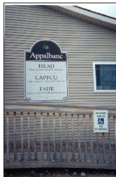
Figure 5. "Open for Business" at FAHE's Berea, Ky. office.

In order to deal with the problems associated with easy credit on predatory terms, FAHE is beginning to encourage its member groups to market the services of its affiliate organizations, CAPFCU and HEAD, under the slogan "Open for Business" (Figure 5). One group, Frontier Housing, is planning to open a "hybrid mini-branch" of CAPFCU in its Morehead, Ky. office. The mini-branch would be able to sign people up for membership in the credit union, take deposits, and originate consumer loan applications for Frontier's client families. Because CAPFCU's field of membership was expanded in 2001 to include any individual who is a member of HEAD, all a client has to do is pay a $5 HEAD membership fee to become a member of the credit union. As the former executive director of Frontier commented, "Being able to offer credit union membership would keep new homeowners from being preyed upon by low-life entities who draw them into unfavorable mortgage loans for consumer purchases."