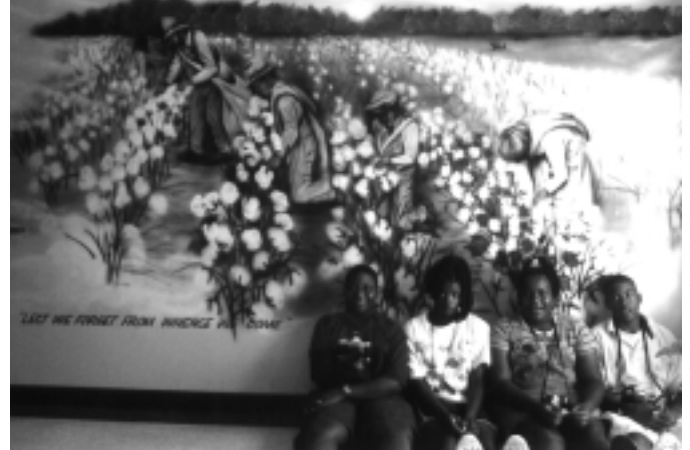
Student photographers involved in helping the Kellogg Foundation to put a human face on its work in the Delta rest in front of a mural in the office of the Quitman County, Miss. Development Center. The Foundation has provided planning and project execution grants in Quitman County.

Accordingly, Delta residents have been empowered within MSDI's decisionmaking structure via the Delta Initiative Advisory Coalition. Kellogg also recognizes that every effort must be made to identify opportunities that will nourish communications and collaborations that include a representative mix of the diverse Delta community.