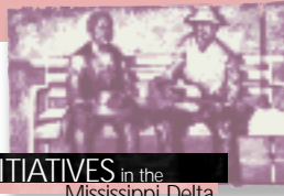
INITIATIVES in the Mississippi Delta