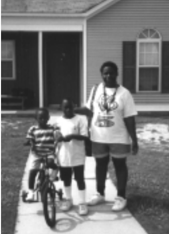
This Arkansas family is proud of their new home.